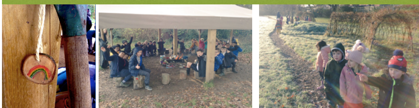
Enjoying the chilly outdoors and christening the new Forest School kettle

Next Tuesday we will be marking Safer Internet Day with a range of learning activities. Keep a look out for these on the home learning programme and if your child is attending school, ask them what they have learnt at the end of the day.