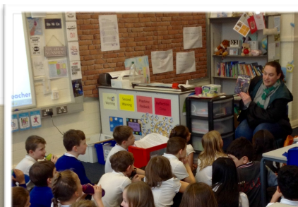
Secret Readers in Class