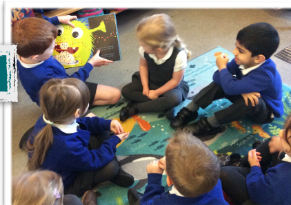
Siblings Reading to Nursery

https://www.youtube.com/watch?v=FUOkVoa1JPE