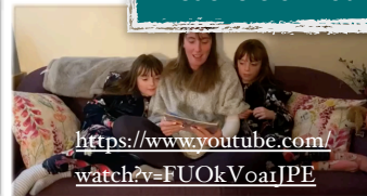
Teachers on You Tube!

https://www.youtube.com/watch?v=FUOkVoa1JPE