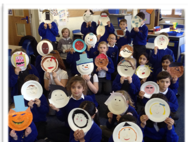
Paper Plate Characters