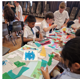
Year 5 visit Kingsway for an art workshop