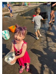
Nursery keep cool in the hot weather