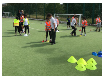
Year 2 play in a mini-golf tournament at North Cheshire Jewish School