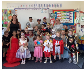
Reception take part in a Royal Gala Ball Immersion Day