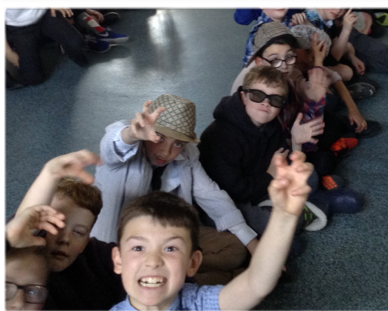
Y4 and 5 Awful Aunties - superb singing too (below!)

The children will have the opportunity to go on stage at the Plaza: Y4 and 5 will be singing and presenting their iMovie book review of Awful Auntie by David Walliams. This book inspired an Awful Auntie day in school this week (see photos opposite). Reception will also be going to the Plaza to present their version of 'We're all going on a bug (not bear) hunt' which has been inspired by the mini beast pop up book "Twist and Hop Mini Beast Hop". It will certainly be an event to remember and we look forward to finding out the winning book titles. Many thanks for parents for supporting this event by making a contribution towards the cost of coaches. It couldn't happen without your help!